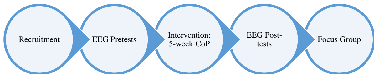
The Research Process